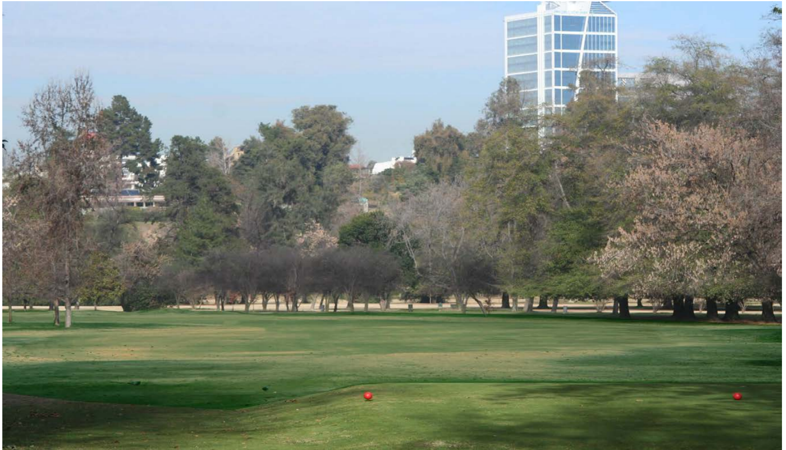
At present from the tee the fairway bunkers are barely visible.